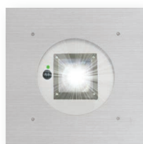
HELO F1 / F1-12 / F1-24

Helos can be integrated into your BACnet Building Automation System to enhance control and reporting and lower your total cost of ownership.