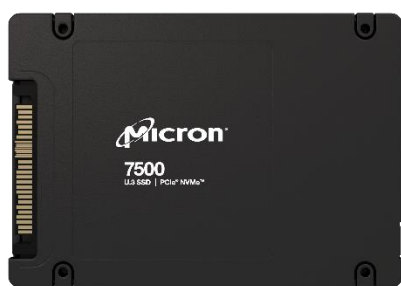
Micron 7500 NVMe SSD (U.3/U.2), 15mm

The 7500 SSD is a versatile solution that delivers the performance required by complex and critical business workloads.